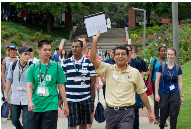
Georgia Institute of Technology

The spread of the coronavirus has forced colleges to cancel countless on-campus programs scheduled for March and April.