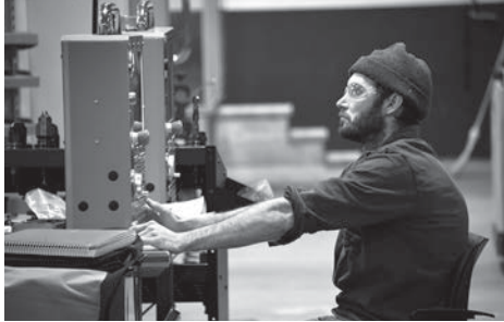
Downtown Campus 120 N. 2nd Avenue West Duluth MN 55802