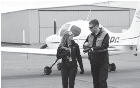
Center for Advanced Aviation 4960 Airport Road, Hanger #103 Duluth, MN 55811