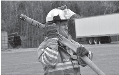
Emergency Response Training Center Truck Driving Center 11501 Highway 23 Duluth, MN 55808